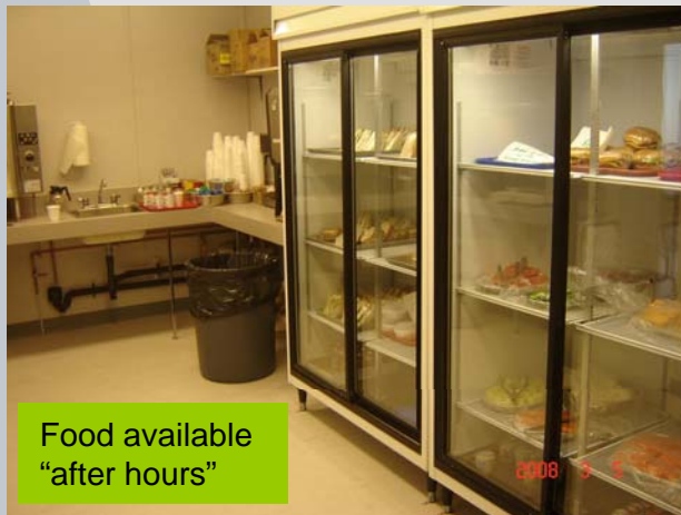
Food available "after hours"