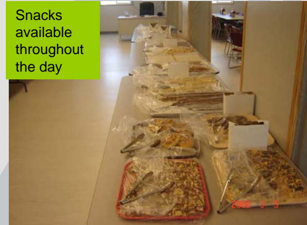
Snacks available throughout the day