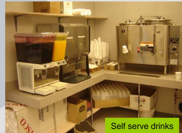
Self serve drinks